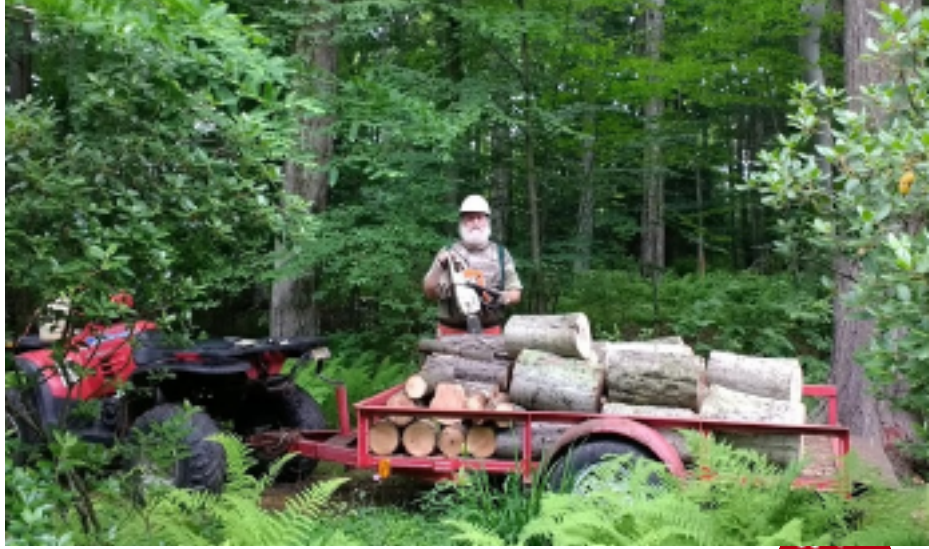
An ATV with trailer is an effective tool for small-scale firewood salvage. This is the author, on vacation in the Poconos.

Keeping your equipment on terrain that is suitable is the first step. Woodlots with excessively steep terrain or boulder ground will not be suitable for some equipment. We have a project where the landowner hires an excavator for a couple days every few years to